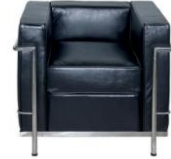
Contemporary Black Leather Love Seat