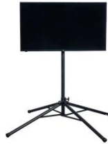
42" Flat Screen & Floor Stand