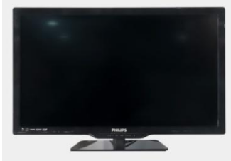
32" Flat Screen Per Day