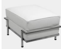
Contemporary White Leather Ottoman