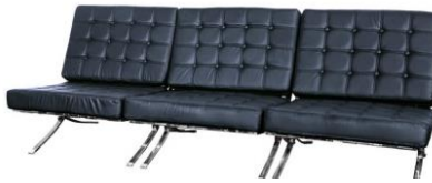
Barcelona 3 Seat Sofa