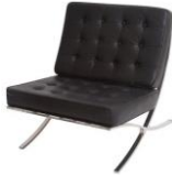
Barcelona Single Seat