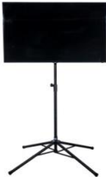
65" Flat Screen & Floor Stand