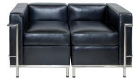
Contemporary Black Leather Love Seat